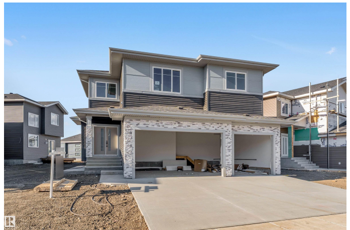
105-eldridge point eldridge point, St Albert, AB

MLS® # E4463338 Price $809,500 Bedrooms 3