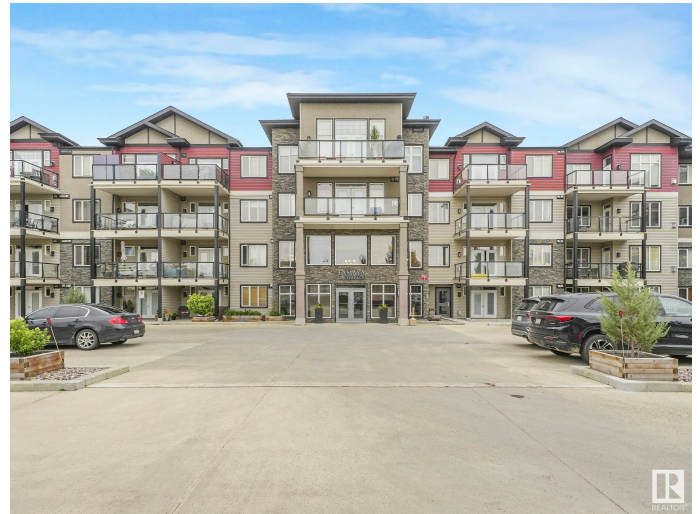
312-12408 15 Ave SW, Edmonton, AB