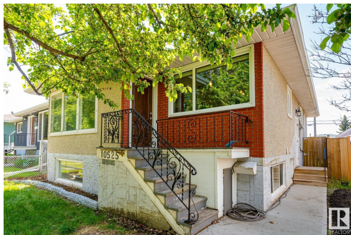
10525 63 Ave, Edmonton