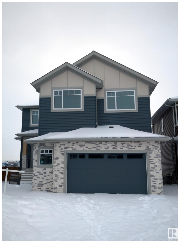
91 Edgefield Wy, St. Albert, AB

2 Storey 2,848 +/- SF on a Walk-Out lot onto the Pond. Fully fenced and Landscaped Plus 1,193 +/- SF Bsmt developed. TOTAL 4,041 +/- SF developed. Designed for family enjoyment plus large gatherings! Enjoy tranquility watching the Sunset over the pond. Covered deck off Dining Room, Primary Suite and at ground level patio. Huge Spa style Ensuite - separate water closet. Double vanity. Invigorate in the spa shower or relax in the huge soaker tub. 3 additional Bedrooms on the same floor all with 4 Pce Bathrooms. Plus, main floor den/bedroom with adjacent full bath. 5th Large Bsmt. Bdrm. Large Kitchen Plus a full 2nd Kitchen. Entertain guests in the Living Room while others relax in the Bonus Room overlooking the Great Room or bsmt family room c/w wet bar w bar stool height island or enjoy the games room. Open design allows flow of natural light thru-out. Store your toys™ in the oversized garage. Access to the Park/Pond/Pathways. Major Shopping, Schools, Recreation Facilities, Major/Minor Arterial Roads